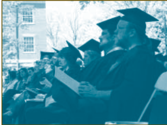
2004 ESR soon-to-be graduates await their pronouncement as ESR alums!

On May 8, 2004, 12 students received the Master of Divinity degree from ESR. These 12 represent the diversity of background and interest typical of ESR. As new graduates from Friends, United Methodists, and Unitarian Universalists traditions, this group goes forth into a variety of ministries.