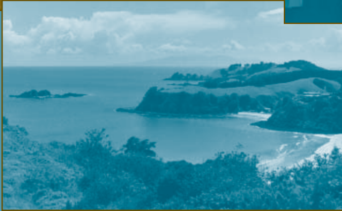
View from Friends House on island off of Auckland, New Zealand.